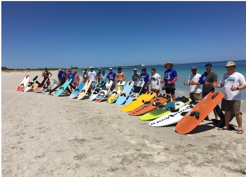
Foil Fleet pre race on Saturday